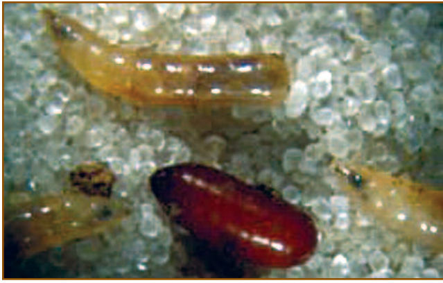
Figure 3. Stable fly maggots and pupa.

The eggs are typically laid in wet straw, wet hay bales (Fig. 4), or other decomposing vegetation mixed with the urine and feces that the animals produce.