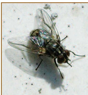
Figure 1. Adult stable fly.

The stable fly, Stomoxys calcitrans (Fig. 2),