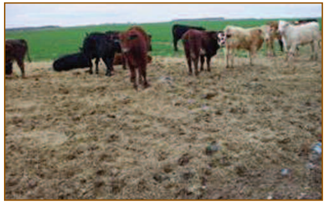
Figure 4. Remnants of hay bales can become breeding sites for stable flies.

them and other mechanical traps every 1 to 2 weeks because the ribbons dry out, become coated with dust, or become “saturated” with flies.