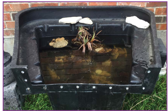
Figure 3. Drain or treat all standing water to prevent mosquito breeding around your home.

Insect repellents are much less likely to harm adults or children than are Zika or other mosquito-borne diseases such as West Nile virus.