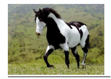
"Often the rear limbs are more severely affected than the front. Signs of brain dysfunction may occur as well," UC Davis says.

EHV-1 can be spread from contaminated caregivers with virus on their hands, vehicles and other inanimate objects. It can also be contracted through airborne transmission and horse-to-horse contact.