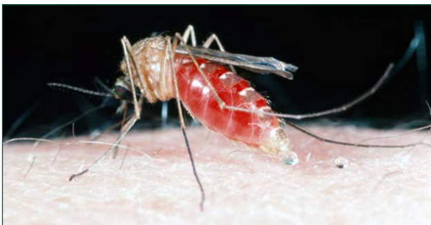
Figure 5. Mosquito adult.

Inactive females rest in protected areas that are typically dark or shaded, humid, and cool in the summer or warm in the winter.