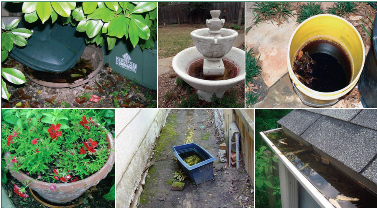
Figure 6. Artificial containers that can serve as mosquito egg-laying sites: (from top left) a garbage can lid, birdbath, plastic bucket of water, flowerpot, plastic container, and a clogged rain gutter.

ual homeowners as well as organized areawide efforts led by groups such as local government agencies or private companies.