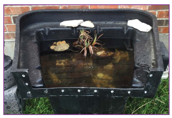
Figure 3. Drain or treat all standing water to prevent mosquito breeding around your home.

Insect repellents are much less likely to harm adults or children than are Zika or other mosquito-borne diseases such as West Nile virus.