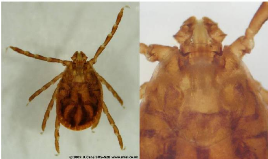
Figure 1: Adult female Longhorned Tick.

The Longhorned Tick (also known as the Bush tick) (Figure 1) is an exotic tick and has been documented as a serious pest of livestock in Australia and New Zealand. Recently, this tick has been found on animals in New Jersey, Virginia, West Virginia and Arkansas. Longhorned Tick can be found on multiple animals and is considered a three-host tick. This three-host tick is unique in that it can reproduce either sexually (male and female mating) or through parthenogenesis. The reproductive biology of this tick can lead to large populations occurring in pastures or on animals in a short period of time if left unmonitored. However, since it is a three-host tick, it will typically complete their life cycle in 6-months with all active life stages (larva, nymph, and adult stages) feeding on animals.